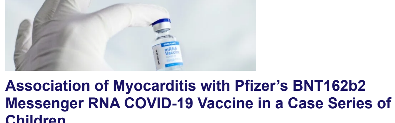
Children Aug 17, 2021